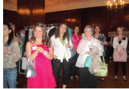
Charlie's House Boutique shoppers.

Please consider Charlie's House in your holiday giving. Happy Holidays!